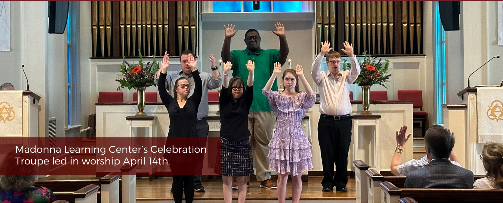
Madonna Learning Center's Celebration Troupe led in worship April 14th.