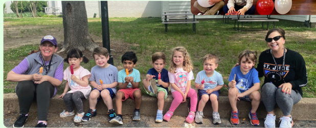
FPDS 2024 Graduating Classes