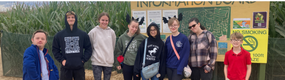
The Youth Fellowship conquered the corn maze!