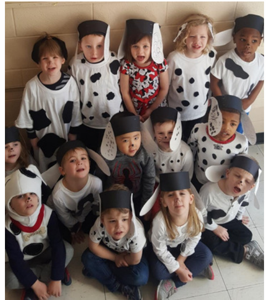
Teachers and students celebrated 101 days of teaching and learning by dressing up as dalmatian puppies.